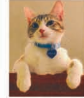
Missy Halpern (alumnus)