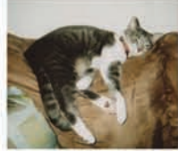
Rascal Wilson (alumnus)