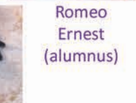
Romeo Ernest (alumnus)