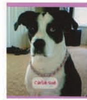
Carlie Sue Gunter (alumnus)